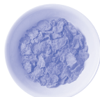
Whole-wheat cereal flakes

1 cup (1-ounce equivalent of whole grains)